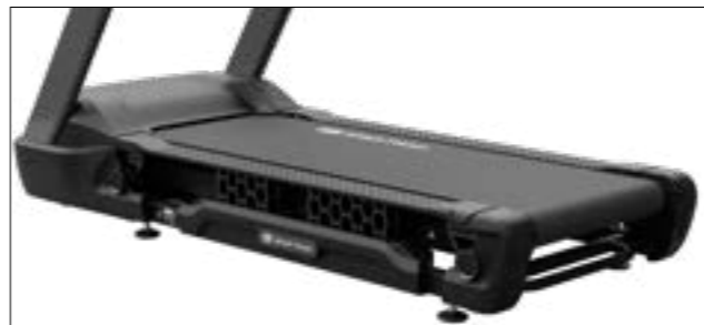
Shadow Edition, featuring Black Hex Deck, also available