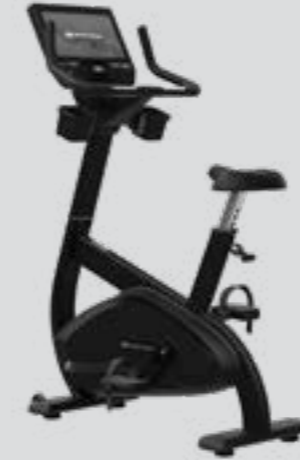
Star Trac Upright Bike 8UB