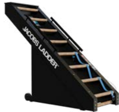
StairMaster Jacobs Ladder