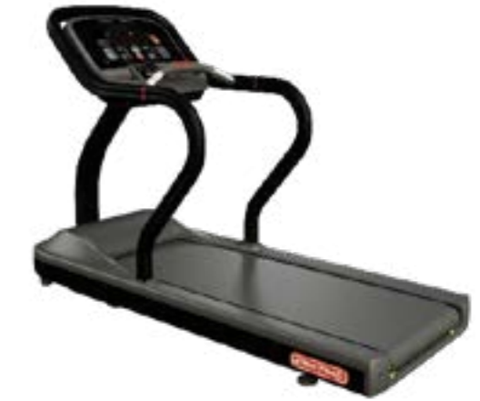
Star Trac STRx

Wireless phone charger Apple + Samsung watch tap to pair for data tracking Cup Holders