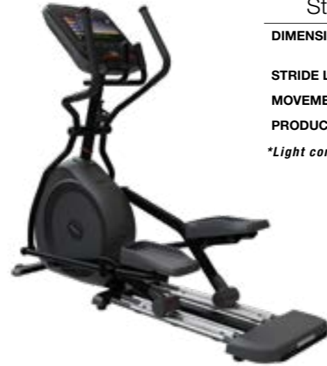
Star Trac Cross Trainer 4CT