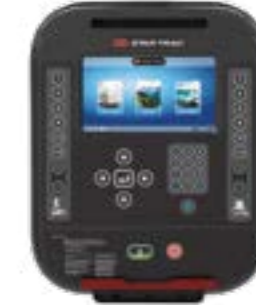
10 in Non-Touchscreen