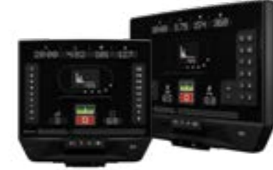
Apex LED Display