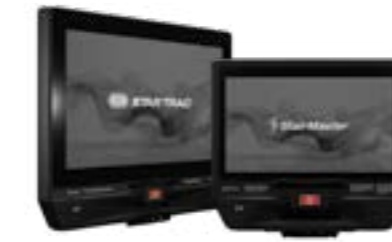
16 in/24 in Apex HD Touchscreen Display