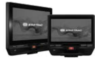
Apex 24 in or 16 in Touchscreen Display