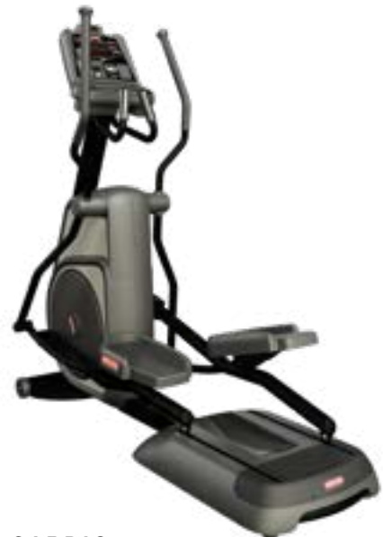
Star Trac Cross Trainer SCTx