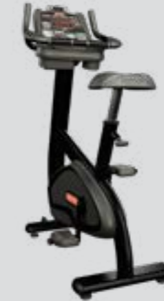
Star Trac Upright Bike SUBx