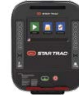
10 in Touchscreen