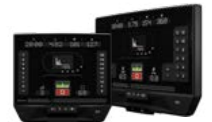
Apex LED Display