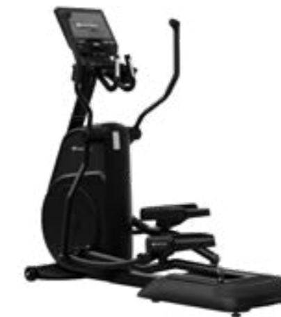
Star Trac Cross Trainer 8CT