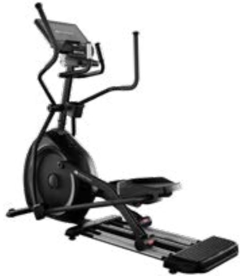
Star Trac Cross Trainer 6CT