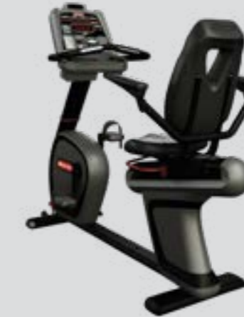
Star Trac Recumbent Bike SRBx