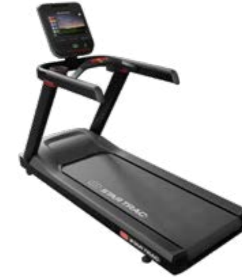
Star Trac 4TR

Wireless phone charger Apple + Samsung watch tap to pair for data tracking Cup Holders