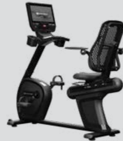
Star Trac Recumbent Bike 8RB