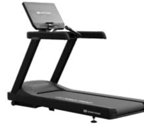
Star Trac 6TR