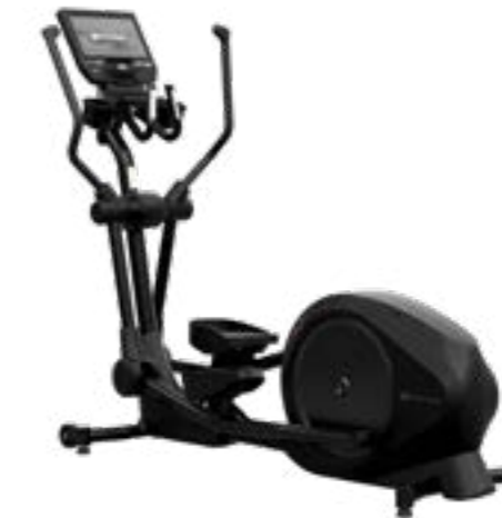
Star Trac Rear Drive Elliptical 8RDE