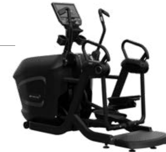
Star Trac VersaStrider™ 8VS