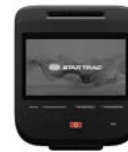
16 in Touchscreen* *Available Q2 2026